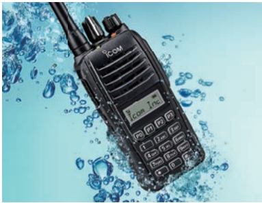
Waterproof for 30 minutes at one meter