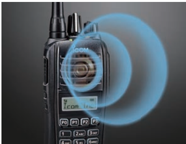
1500 mW powerful audio