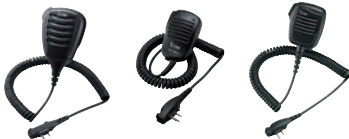
HM-168LWP HM-158LA HM-159LA

HM-159LA: Speaker microphone with 3.5 mm earphone jack.