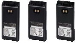
BP-278 BP-279 BP-280

BP-280: 2400 mAh (typ.), 2280 mAh (min.) rechargeable Li-ion battery.