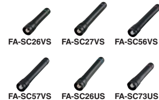
FA-SC26VS FA-SC27VS FA-SC56VS FA-SC57VS FA-SC26US FA-SC73US