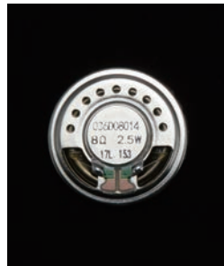
Icom custom high power handling capacity speaker